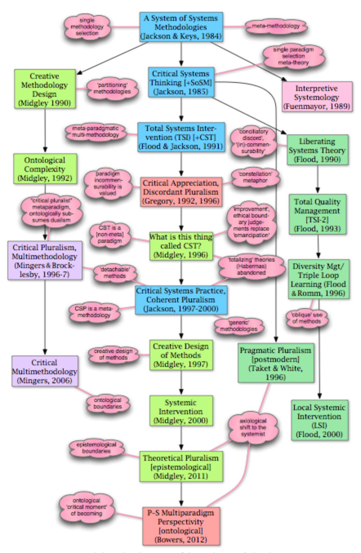
Figure 2. Philosophical aspects of the evolution of pluralism in CST.